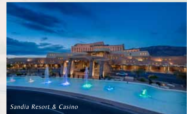
Sandia Resort & Casino

You can also visit https://book.b4checkin.com/chameleon/sandia/rlp/41stAnnualNMAFPWinterRefresher , which will take you directly to the NM Academy of Family Physicians room block.